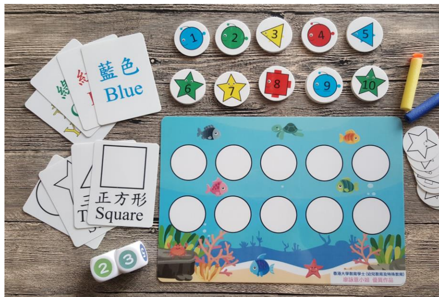
2022: Happy Fishing