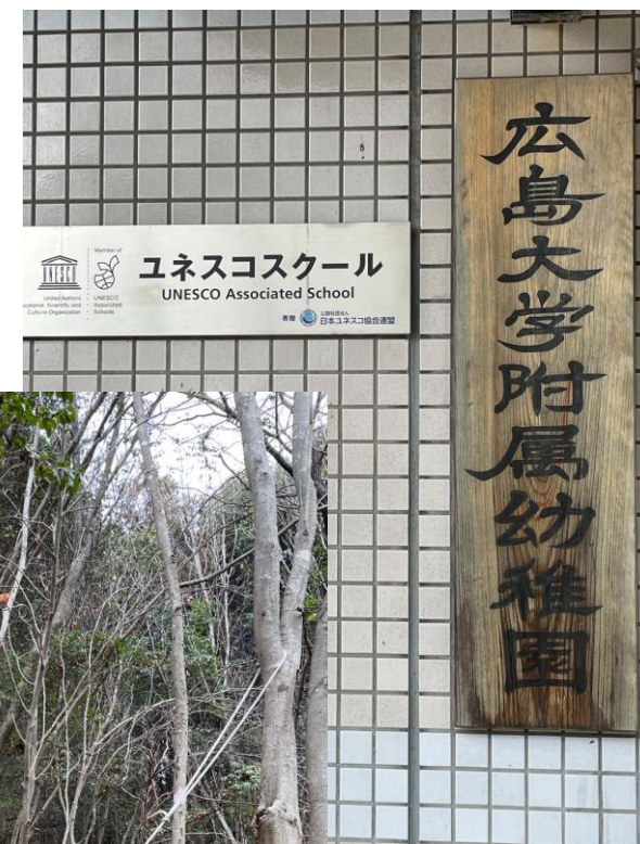
Hiroshima University Attached Kindergarten