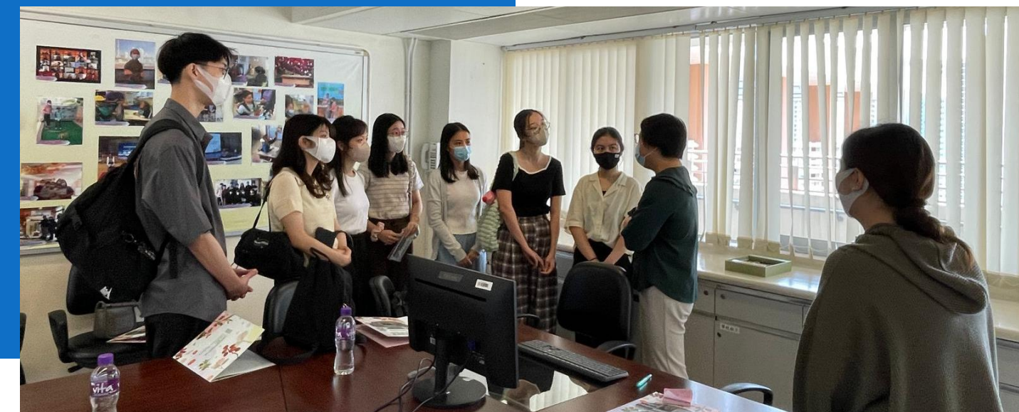
School visit: Cornwall School (Special school)