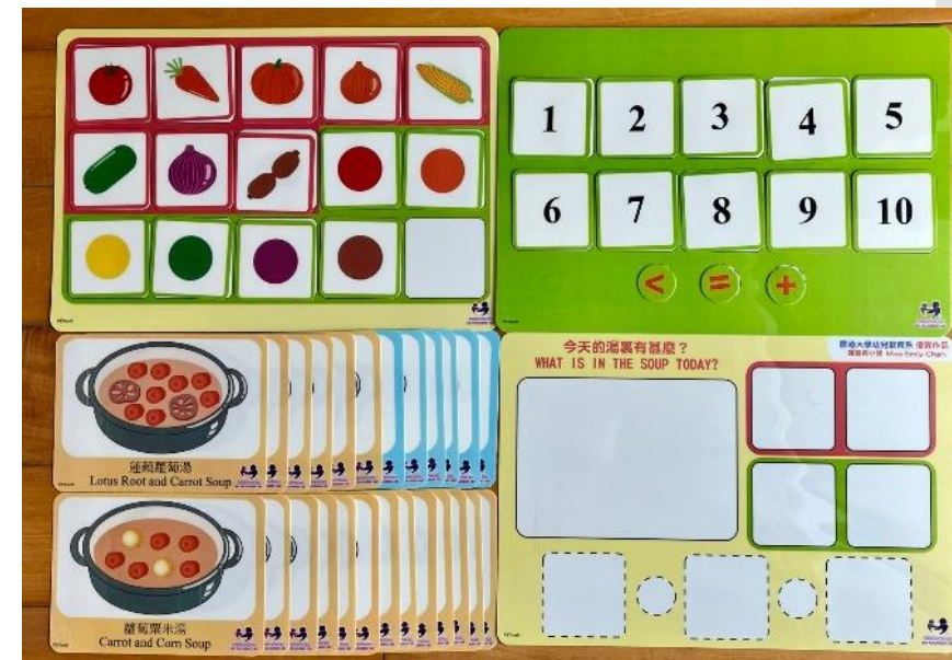
2023: What is in the soup today?