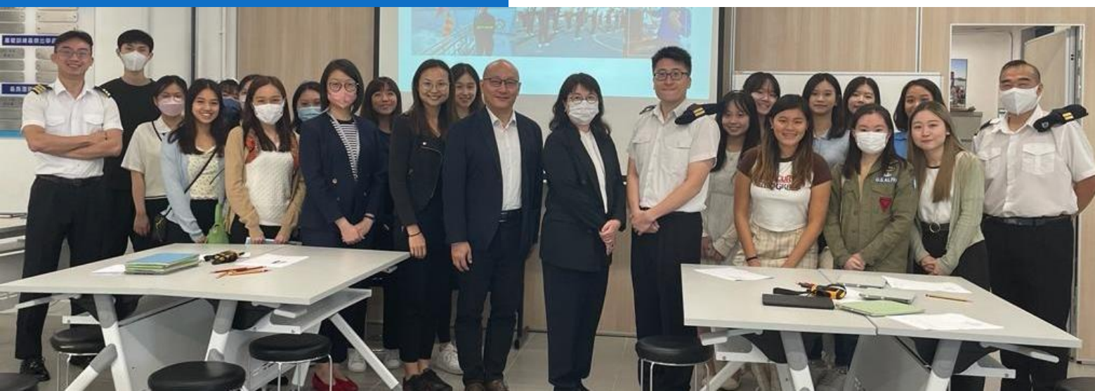
Hong Kong Sea School (Secondary school)